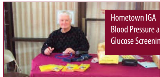
Hometown IGA Blood Pressure and Glucose Screenings