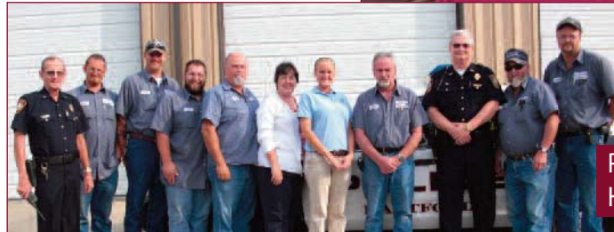
Participants of the City of Hartford Health Fair